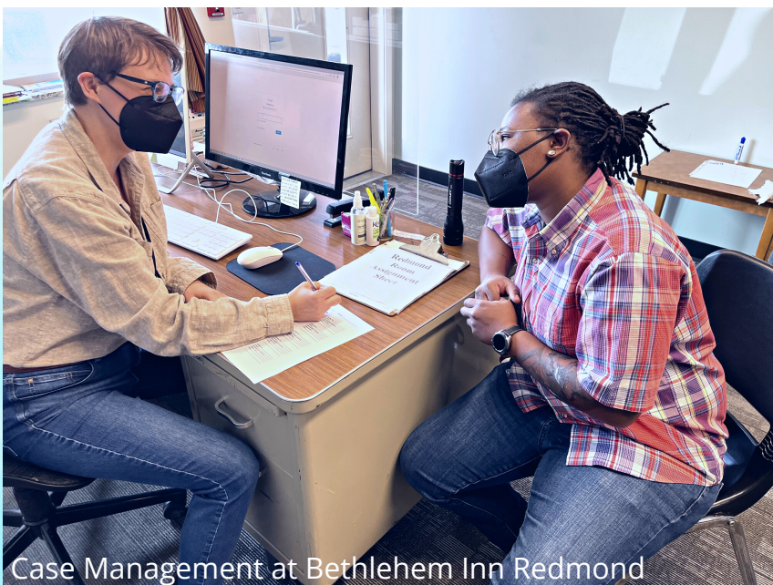
Case Management at Bethlehem Inn Redmond

"Bethlehem Inn is a new opportunity to continue helping people"